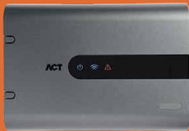
ACTpro eLock Hub