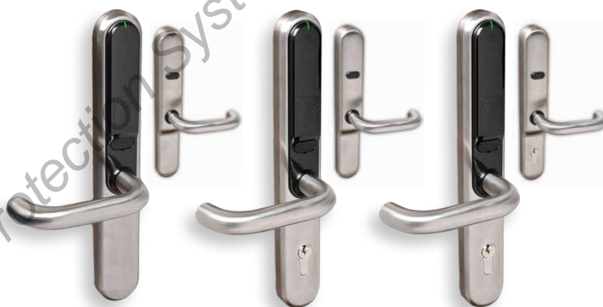
ACTpro eLock with key override on outside

Product Code: ACTpro eLock (125KHz RFID version)