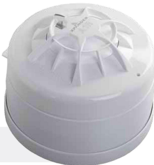
A1R XPA-CB-11170-APO CS XPA-CB-11171-APO XPander Heat Detector with Radio Mounting Base