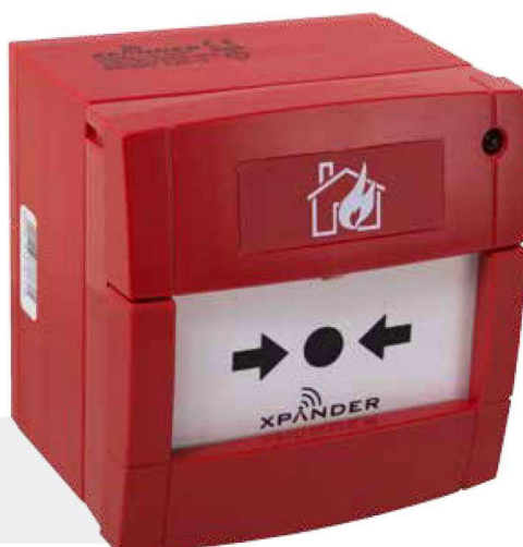
XP-PA-MC-14006-APO XPander Manual Call Point